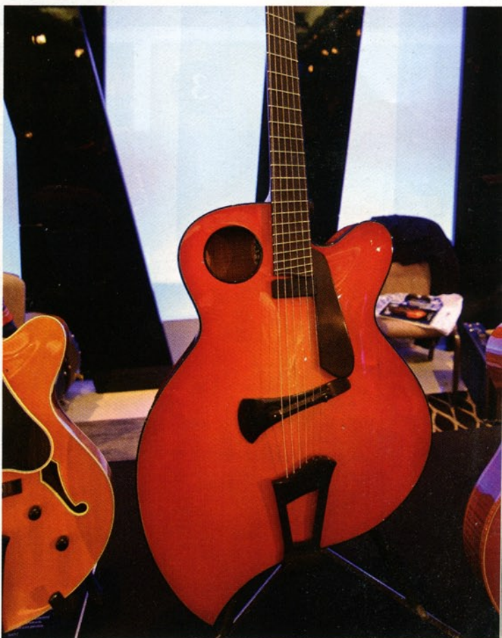
Tom Ribbecke's fan-fret Halfing is so-named because it combines a bass side that's flat like a steel-string acoustic with a treble side that's carved like an archtop. ribbecke.com ►►