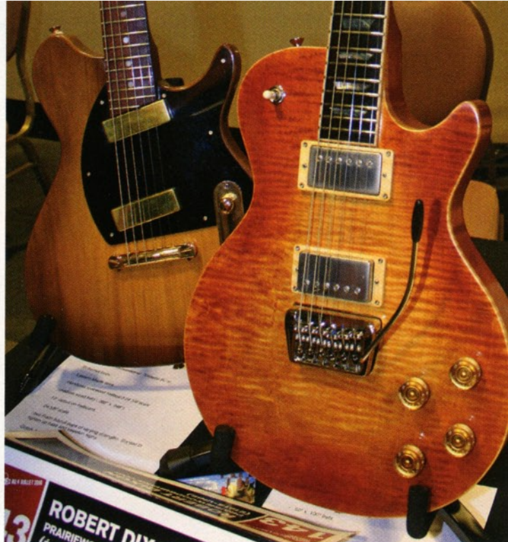
Prairiewood Guitars' Midwesterner (left) features a butternut body, while the Hardtop (right) has an Eastern maple body. prairiewoodguitars.com